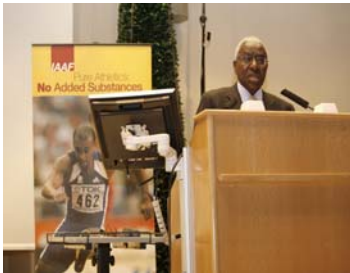
President Lamine Diack

The 3rd IAAF World Anti-Doping Symposium took place in Lausanne, Switzerland , from 30 September until 2 October 2006 before an audience of nearly 400 participants from all around the world, composed of representatives of IAAF federations, but also WADA, the IOC and other sports organizations, laboratories, other anti-doping professionals and representatives of the Media, who had full access to all the sessions.