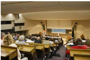
General view of Symposium