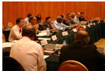
General view of Council top table

confirmed as clean. So far in 2006, IAAF doping sample officers have reported 166 unsuccessful attempts to collect out of competition samples from athletes; after investigation, 22 have been defined as "Missed Tests".