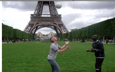
16 May, Paris: Jonathan Edwards and Ladj Doucouré