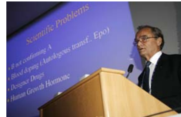
Prof Arne Ljungqvist

The final athlete to speak was Debbie Ferguson, a medallist at the last three Olympic Games. She spoke with a composure and passion that left all participants in the auditorium in no doubt of the commitment that the majority of athletes have to compete drug free.