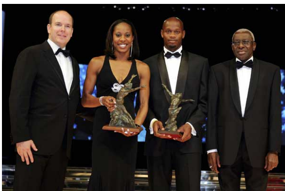
HSH Prince Albert II of Monaco, Sanya Richards, Asafa Powell, and IAAF President Lamine Diack at the World Athletics Gala in Monaco

Building a legacy for Athletics cannot happen overnight. All my predecessors began the building process by laying the foundations, and as senior Vice-President in the 80s, I was encouraging the life mission to transform the sport.