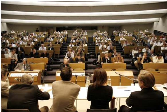
General view of speakers and audience at 2006 IAAF World Anti-Doping Symposium in Lausanne, Switzerland

The 2006 IAAF World Anti-Doping Symposium in Lausanne, like those held in Florence in 1987 and in Monte Carlo in 1989, was born of the IAAF's determination to remain at the forefront of the fight against doping, a fight we are determined to pursue relentlessly.