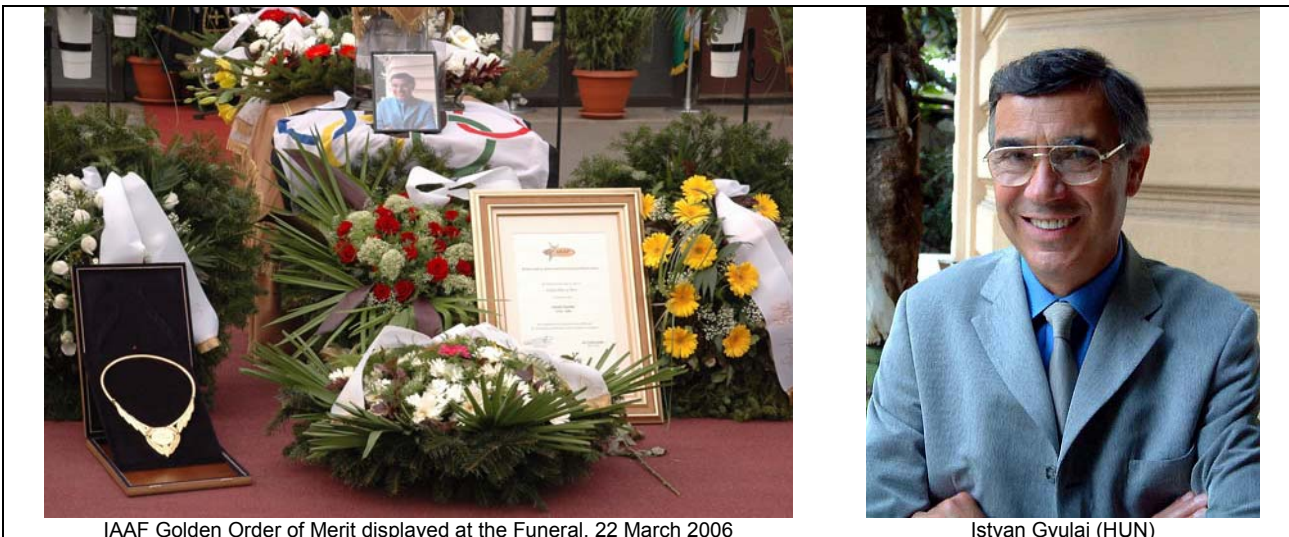
IAAF Golden Order of Merit displayed at the Funeral, 22 March 2006

The commemoration of Istvan Gyulai's life continued one week later on Wednesday 22 March 2006 in Budapest, Hungary, when a Mass was held at Szent Istvan Bazilika, which was followed by the Funeral at Pesterzsébeti Temető, at which on behalf of the IAAF, President Lamine Diack made the posthumous presentation of the IAAF's highest honour, the Golden Order of Merit.