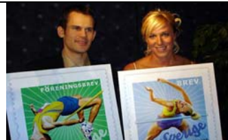
Stefan Holm and Kajsa Bergqvist with Gothenburg stamps