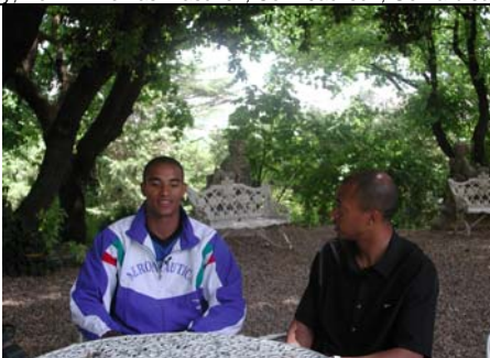
17 May, Rome: Andrew Howe and Stéphane Diagana