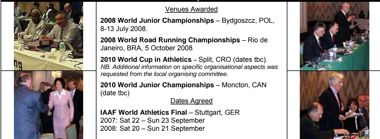
Photographs: Clockwise beginning top left – Lamine Diack and Pierre Weiss; Split delegation makes their presentation; Abby Hoffman speaks on behalf of Moncton; Irene Szewinska who led the Bydgoszcz delegation is congratulated on successful 2008 bid.