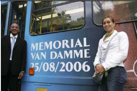
8 May, Brussels: Frank Fredericks with Kim Gevaert

As well as being in Oslo, Colin Jackson had also visited Berlin for a promotion, and some of his fellow IAAF Ambassadors had also been busy in the previous few weeks promoting the IAAF Golden League in its other four host cities. Frank Fredericks (NAM) was in Brussels, Wilson Kipketer (DEN) in Zurich, Jonathan Edwards (GBR) in Paris, and Stephane Diagana (FRA) in Rome.