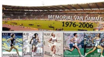
30th Anniversary - Memorial Van Damme meeting

in Gothenburg, Sweden. The four stamps highlight four truly exceptional Swedish individuals - Kajsa Bergqvist, Stefan Holm, Carolina Klüft and Christian Olsson – in spectacular action.