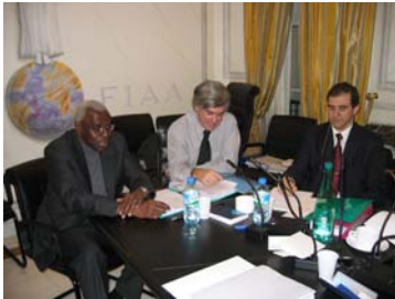
Photo: President Diack addresses the Technical Committee

The yearly Technical Committee meeting took place at the IAAF Headquarters in Monaco starting in the afternoon of 17 February with Technical Committee Working Group meetings and then a full day meeting of the whole Committee on 18 February. All but two of the members of the largest IAAF Committee were present.