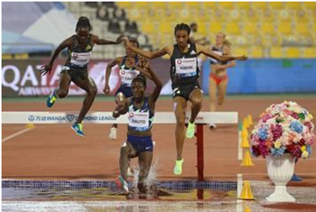
World leads and meeting records set as Wanda Diamond League heats up in Doha