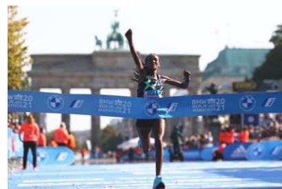
Debutante Gebreslase and Adola triumph in Berlin