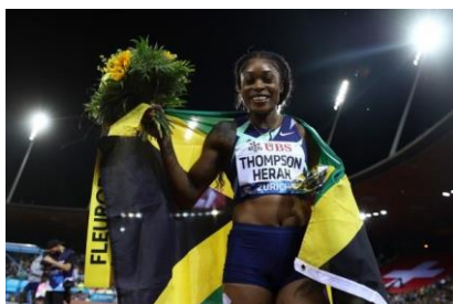
Another record falls as Thompson-Herah claims Diamond League crown