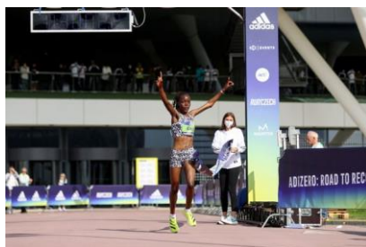
Tirop and Teferi smash world records in Herzogenaurach